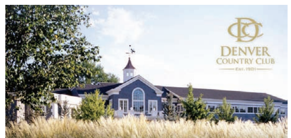
Denver Country Club • 1700 East First Avenue, Denver 80218

Save the date now, more details and a registration link is coming soon!